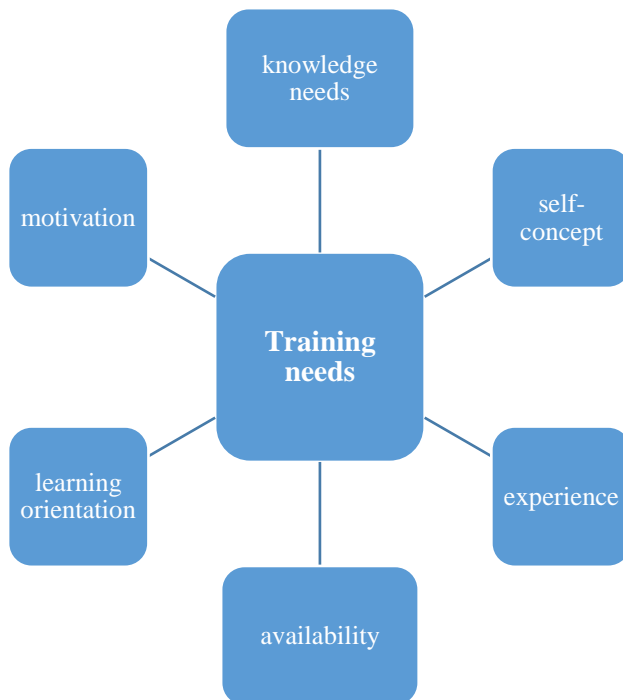
Figure 2. Specific learning needs in adult education (Knowles et al., 2005)

Understanding the training needs of andragogy prepares facilitators to create successful programs for adult learners. To develop the quality of education of teachers and to facilitate socio-professional integration, emphasis will be placed on the training and development of a set of skills with general and specific functions.