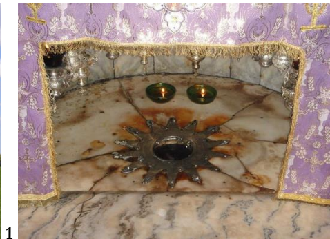
Fig.1 and 5 - The Stonehenge sanctuary( https://en.wikipedia.org/wiki/Stonehenge )and Nativity altar in Bethlehem ( https://en.wikipedia.org/wiki/Church_of_the_Nativity#/media/File:Nativity_Grotto_Star.jpg ), p. 206 and p. 312, respectively, in Geografia sacră by D.Gromov (ed.), translated from Russian into Romanian by Marina Vraciu (Chisinau, ARC, 2008)