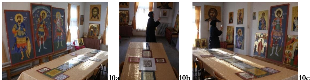
Fig. 10 (a,b,c)- Sequences from a 2013 students' exhibition, Sacred Art (Cultural Heritage at the time), Faculty of Orthodox Theology, Alexandru Ioan Cuza University, Iași: new and restored icons, miniatures, old church books, restored.