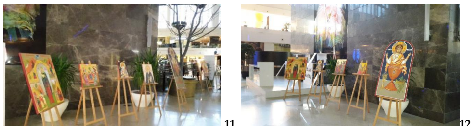
Figures 11, 12 - An exhibition by students of Sacred Art - Cultural Heritage, Faculty of Orthodox Theology, Alexandru Ioan Cuza University, Iași: icons, mural panels, Atrium Room in Palas Mall, Iași, 10-15 November 2015 (joint coordination-organization).